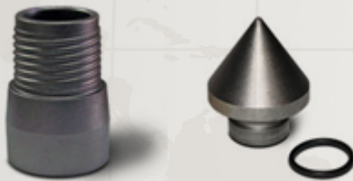
2.25 Point Holder for 2.25 Exp Point -(33764) SP22 Exp Point Holder (2.25 PT) -(AT2015) 2.25 Exp Point

The versatile SP22 groundwater sampler can be used in a traditional drive and deploy manner for groundwater grab samples or in conjunction with the DT22 soil sampling system to provide profiling methods of soil and groundwater.