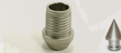
2.25 Point Holder for GW1555 point -(43128) SP22 Exp Point Holder (GW1555 PT) -(GW1555K) SP Exp Point (box 25)