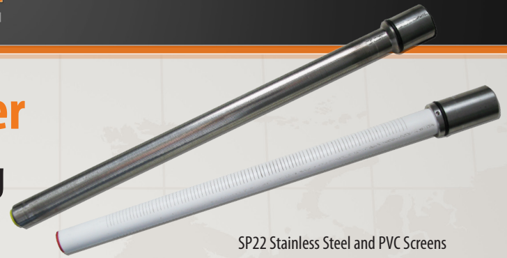
SP22 Stainless Steel and PVC Screens Available in 12- and 48 in. lengths *Shown with Screen Head

The versatile SP22 groundwater sampler can be used in a traditional drive and deploy manner for groundwater grab samples or in conjunction with the DT22 soil sampling system to provide profiling methods of soil and groundwater.