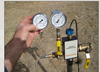
Interchangeable pressure and vacuum gauges allow for performing rising or falling head tests.