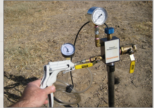
Hand pump has a valve that allows for changing from pressure to vacuum so that rising or falling head tests may be performed.