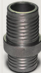
Macro-Core® Liner Cutter Manufactured under Patent #6029355