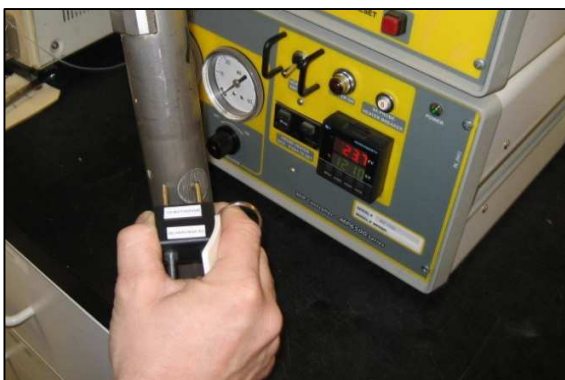
Fig. 2: EC dipole test on a MIP probe

Response testing in MIP logging includes performing chemical responses tests (Figure 1) using a chemical standard of an expected site compound (or similar compound). This test will validate that the contaminant detection system is working from the membrane to the detectors for that type of compound, i.e. Benzene, Toluene or Gasoline for a petroleum site, PCE for a dry cleaner site (not all inclusive). It is crucial that the operators and their customers have confidence that the MIP detector system brought to the site will be able to detect the contaminants present.