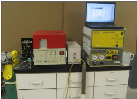
Fig. 1: MIP Chemical response test

Geoprobe Systems® trains operators in the proper techniques for direct image tool operation as outlined in the Geoprobe® SOPs for MIP, EC and HPT and in the ASTM standard (ASTM D 7352-07) for MIP logging. This includes how to perform the required QA testing. Any time an instrument is used to collect data, QA tests must be performed to ensure that the instrument is capable of generating good data. With Geoprobe® Direct Image® logging tools, response testing is the QA test that will prove that the instrumentation is capable of generating