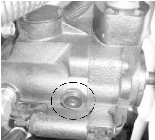
Figure 1. Hydraulic pump and bleeder plug used on Model 54DT machines.