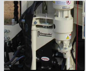
2 Speed Rotary Head Attachment