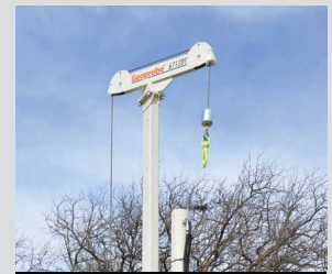
Hydraulic Winch and Mast

The track section of the 6712DT is lowered to a site on the mountainside to advance 4.25-in. hollow stem augers to install 2.0-in. monitoring wells.