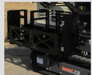
Locking Side Mount Rod Rack