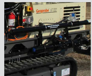
Extruder w/ 2L4 Mounting Kit