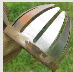
DT45 SS Core Catcher