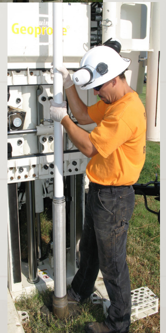
Geoprobe® 2.0 in. Prepacked Screen Monitoring Well