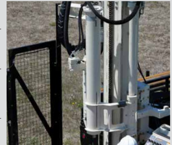
DH106 Automatic Drop Hammer (229261)