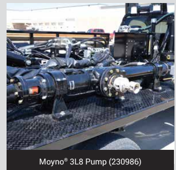
Moyno® 3L8 Pump (230986)