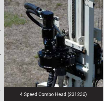
4 Speed Combo Head (231236)

231032 Heater Display Kit 226601 Mud Tub, 175 Gal. 230956 Pull Cable E-stop Asm