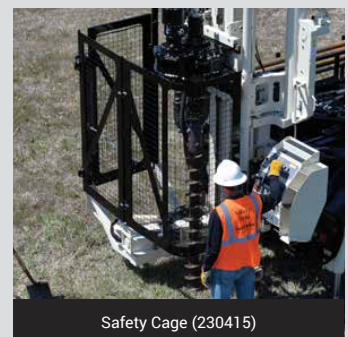
Safety Cage (230415)