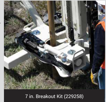
7 in. Breakout Kit (229258)